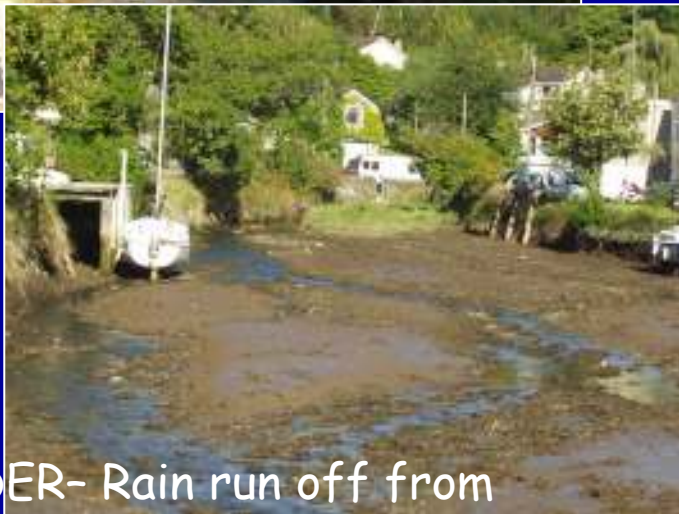
FORDER- Rain run off from Broadmoor runs through Burraton Coombe and ENDS UP HERE at Forder Creek