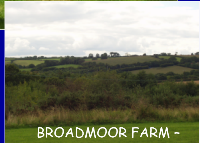
BROADMOOR FARM - bordered by two areas designated as AONB's